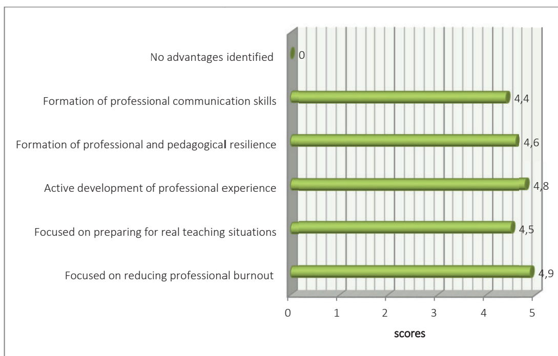
Figure 3 - Advantages of social and emotional learning based on the responses of future educators

The educational process involved identifying the existing advantages of social and emotional learning. The results were obtained with the help of students who participated in the study, focusing on the practical approach of such education. The final indicators are presented in Figure 3.