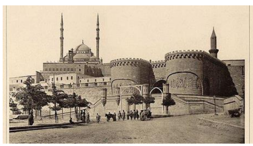
Bab al-Azab historic area

Only thirty years later, I mean after the Italian studies and designs were officially submitted, the Supreme Council of Antiquities (SCA) and the Sovereign Fund of Egypt (SFE) signed a contract to develop and manage the area, as a part of Historic Cairo's rehabilitation governmental efforts. XIX