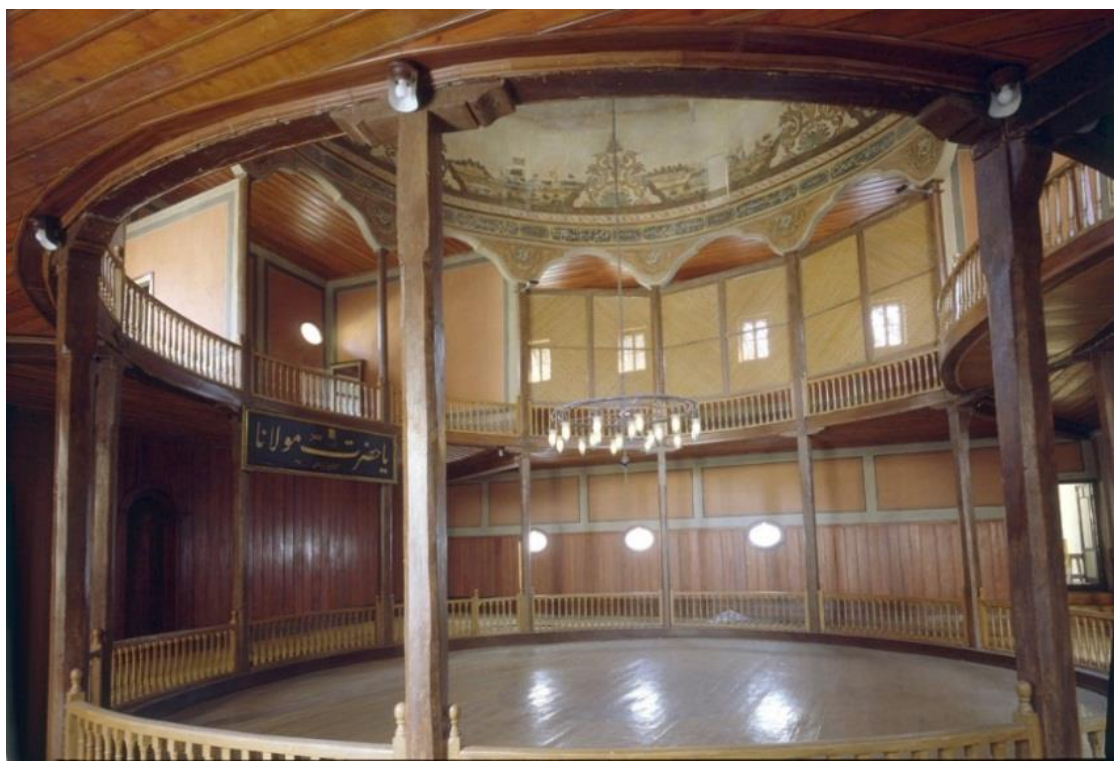
Sama`khana Mevlevi Derwishes after Italian restoration

Sunqur Sa'di, the Mausoleum of Sunqur Sa'di; the Cells of the Mevlevi Convent, in front of the Sama'khana; and the reception spaces in the Wing of the Convent along al-Suyufiyya Street. The Center was an extension of a long history of Italian archaeological work in Egypt. In the occasion of the inauguration, the restored Sama`khana Mevlevi Derwishes, cultic building with a theatre-like layout and characterized as specific architectural typology, was opened to the public. The restoration work carried out by the Italian side. Twenty years later, XV and after long-term discussions and negotiations, Egypt and Italy agreed to institutionalize the School for the conservation and restoration of buildings and monuments , located in the complex of the Meylevi Dervishes. XVI