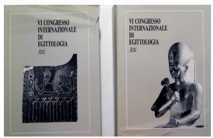
VI Congresso Internazionale di Egittologia – Atti Publisher: International Association of Egyptologists, Turin, Italy, 1992.