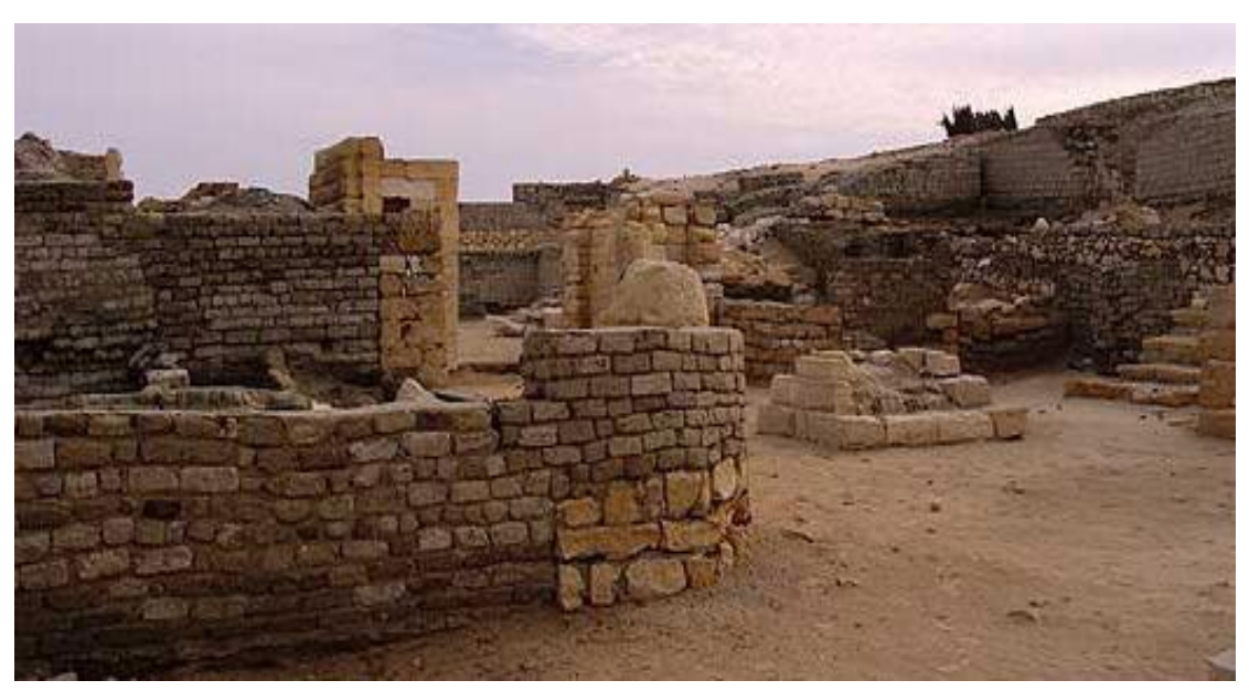
Overview of ruins of Medinat Madi

On January 1, 2008, the al-Qahira reported that the Italian side, in collaboration and cofinanced with Egypt, developed and restored the Medinat Madi ' City of the Past '<sup>LII</sup> in Fayoum region at a cost of 8 million Egyptian pounds. Medinat Madi enjoyed great historical importance in the Roman era, as it was the route of commercial caravans to transport supplies and consumables to Alexandria and back to Rome. Fayoum was an essential supplier for the Roman Empire. The Middle Kingdom temple of Medinat Madi was dedicated to worship the God Sobek or Sebek, a crocodile-headed man with a feathered crown, Patron of the strength of the pharaoh, who was the official God of Fayum. In the Roman and Ptolemaic period, other structures and compartments were added to the Temple. In addition, the project will also include the establishment of a visitor center, museum exhibition hall and tourist service bazaars. Medinat Madi will also be connected to Wadi al-Rayyan<sup>LIII</sup> by a road that facilitates movement to different tourist places. LIV