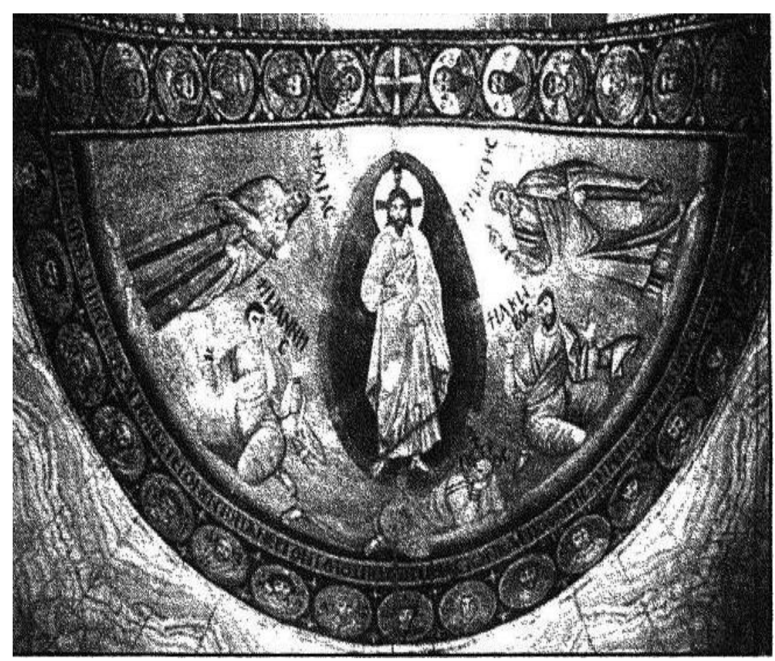
The apse mosaic as published in al-Qahira in 2006

On December 12, 2006, the al-Qahira provided details on the restoration work of the Church of the Transfiguration ( Monastery of St. Catherine ) by the Italian Centro di Conservazione Archaeologica (CCA). The Church, constructed by the Byzantine Emperor Justinian, suffered serious damage from an earthquake in 1995. The restoration included the apse mosaic of the Transfiguration, representing Christ, the Prophet Moses, the Prophet Elijah, and the disciples of Christ. This mosaic is considered one of the oldest and most beautiful mosaics of the East, which was built in the 6<sup>th</sup> century AD. It was agreed with the Italian side to complete the entire restoration process. XXXVII For the conservation works, the Monastery received a donation of $500,000 from Sheikh Hamad bin Khalifa, the then Emir of Qatar, and a further sum of $250,000 from the Getty Foundation. As for the missing parts of the mosaic, the Italians already completed it after making these parts in Venice using the same material of the original mosaic, such as lime based mortars and glass mosaic tiles. XXXVIII It is worth mentioning, that the conservation of the mosaics was finished after ten-year work, XXXIIX and the CCA received the EU Prize for Cultural Heritage / Europa Nostra Awards in the category Conservation for the project of conservation of the apse mosaic of the Transfiguration. XL