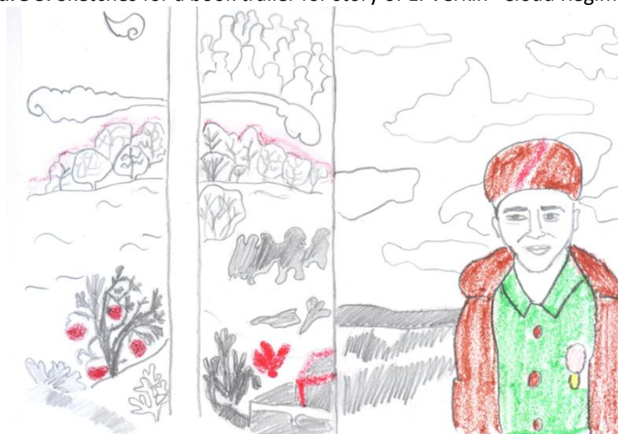
Figure 3. Sketches for a book trailer for story of E. Verkin "Cloud Regiment".

The book trailer introduced the main characters of the story – children, who attracted the attention of schoolchildren. However, experts saw a disadvantage in the fact that the video took a long time – it lasted for 3.5 minutes, so it was difficult for the authors to keep the attention of the reader-viewer on text comments without a voice-over.